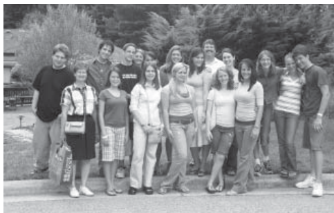
Youth from the Church of Jesus Christ of Latter Day Saints visit the Tammy Lynn Center for their community service project.

Thank you to the following groups who have recently come to share their time and talents with the Tammy Lynn Center: