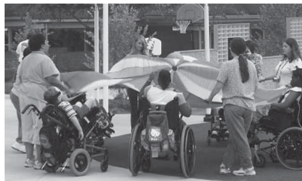
Summer Campers and Staff enjoy a game of parachute ball at Field Day.

program equipped with the skills to continue their educational progress.