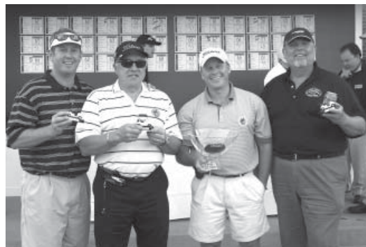
Winners of the 2005 A Challenge at the Creek