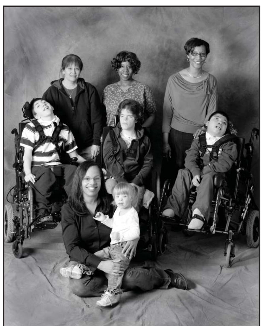
Cover Photo: Children, residents and staff of Tammy Lynn Center programs and services.

Helping Children and Adults with Special Needs since 1969