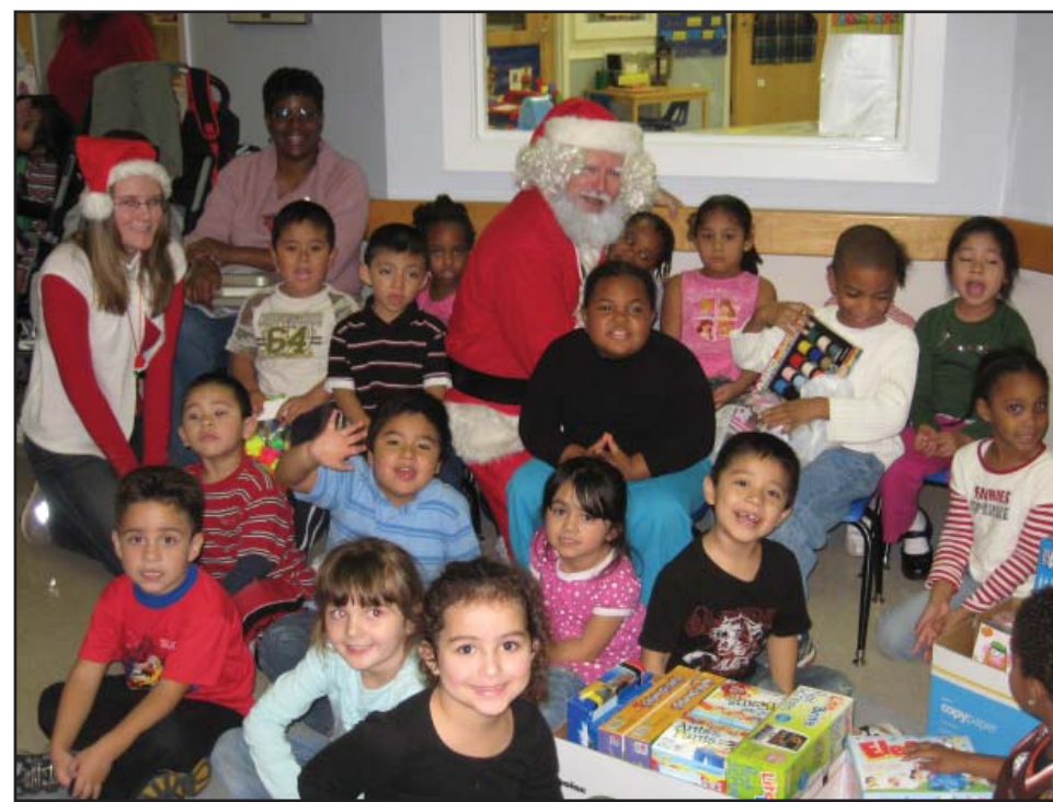
Santa and his helper with our preschoolers during the Holiday party.

Tammy Lynn Center for Developmental Disabilities offers educational, residential and family support services to children and adults with special needs. The Center's goal is to provide the individuals it serves the opportunity to maximize their abilities in a loving, nurturing environment.